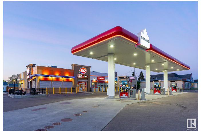
4820 50 Ave, Gibbons AB