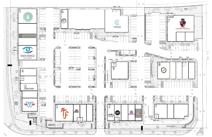
■ Pylon Sign