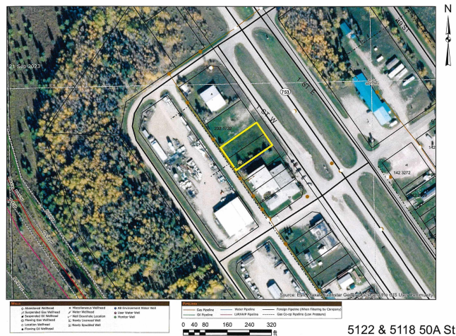
5122 & 5118 50A St

Great location along the main street in Cynthia. West Pembina Field Office is directly beside these two lots. The water and sewer are on the property line in the back alley. This is a main Hwy for traffic and Great exposure to for your business. Priced to sell!