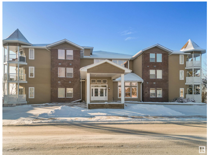
102-4128 47 St, Drayton Valley, AB