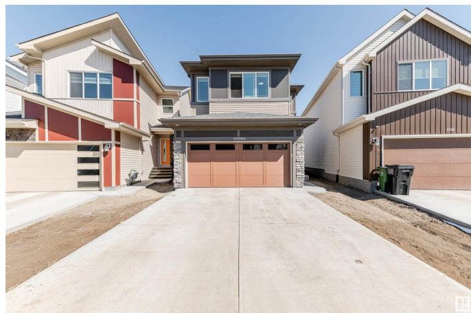
2023 157 St SW, Edmonton, AB

Main Floor Exterior Area 1046.51 sq ft Interior Area 973.00 sq ft Excluded Area 428.21 sq ft