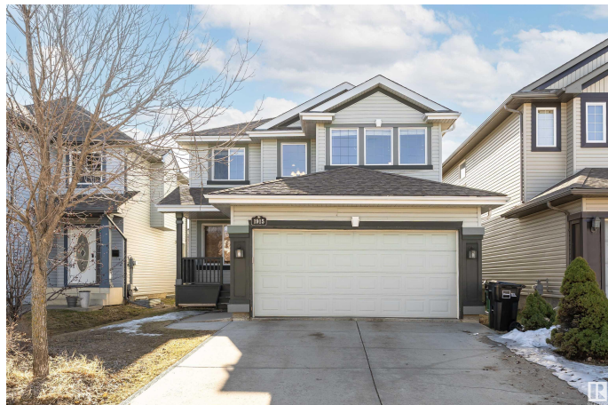
1915 120 St SW, Edmonton, AB

MLS® # E4430184 Price $569,900 Bedrooms 3 Bathrooms 2.50